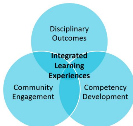
Figure 2. The Role of ILEs in the Pedagogical Model

ILEs refer to activities that meet all three of the following criteria: